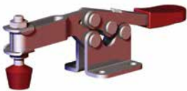
215-U Flanged Base U-Bar