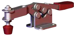
215-U Flanged Base U-Bar